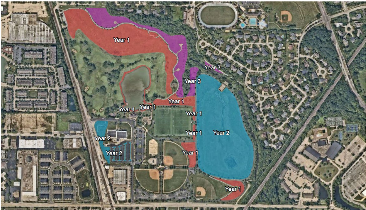
Techny Prairie Park and Fields and Anetsberger Golf Course