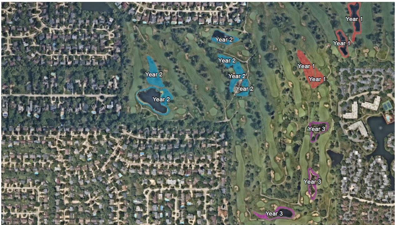
Heritage Oaks Golf Club Central and East