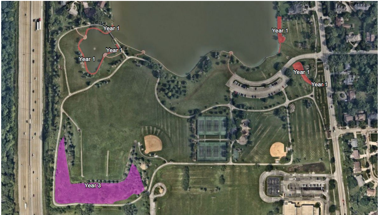
Wood Oaks Green Park