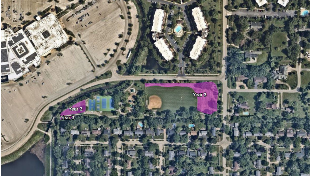
Williamsburg Square Park