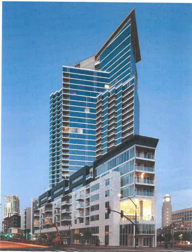
Ballpark Village San Diego, California